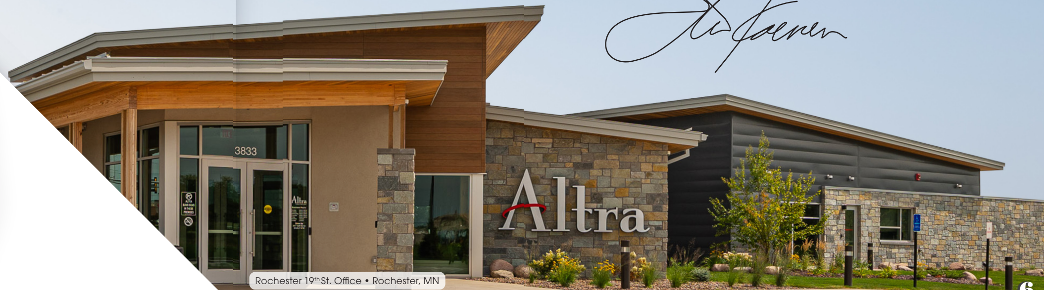
Rochester 19th St. Office • Rochester, MN