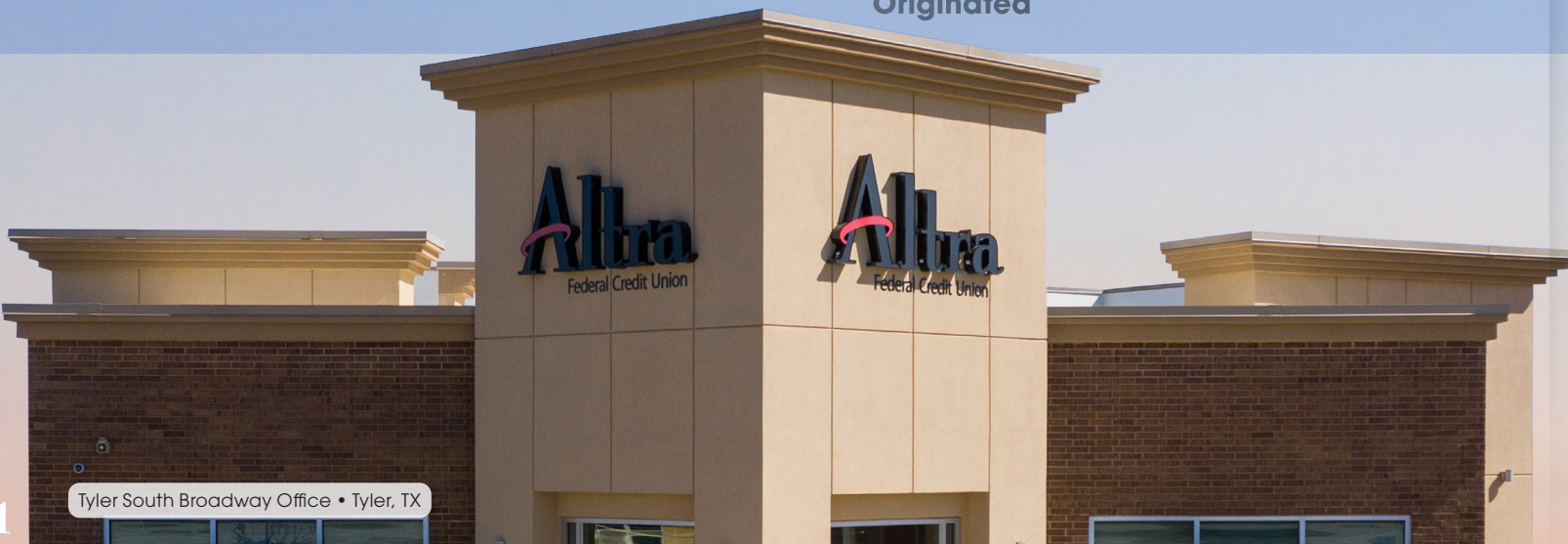
Tyler South Broadway Office • Tyler, TX